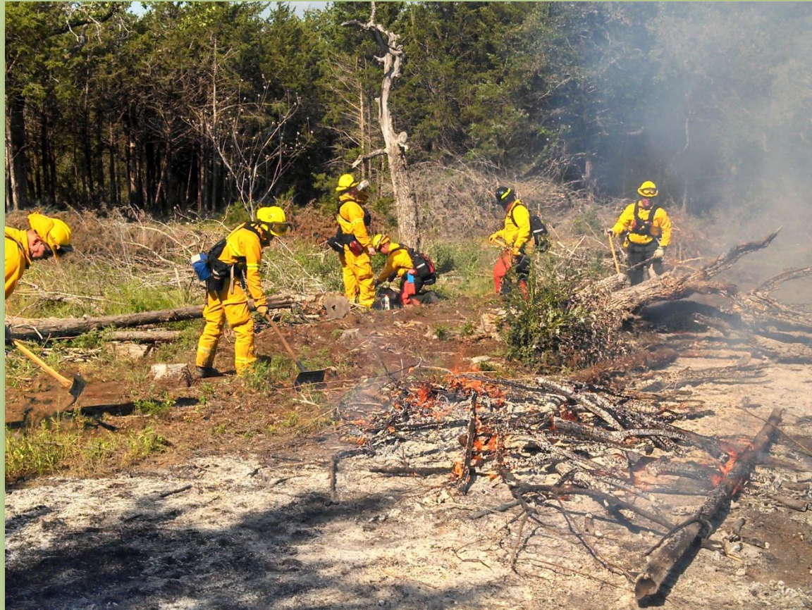
Dallas Fire and Elm Fork Module members bone piling and improving line around a simulated lightning strike fire.