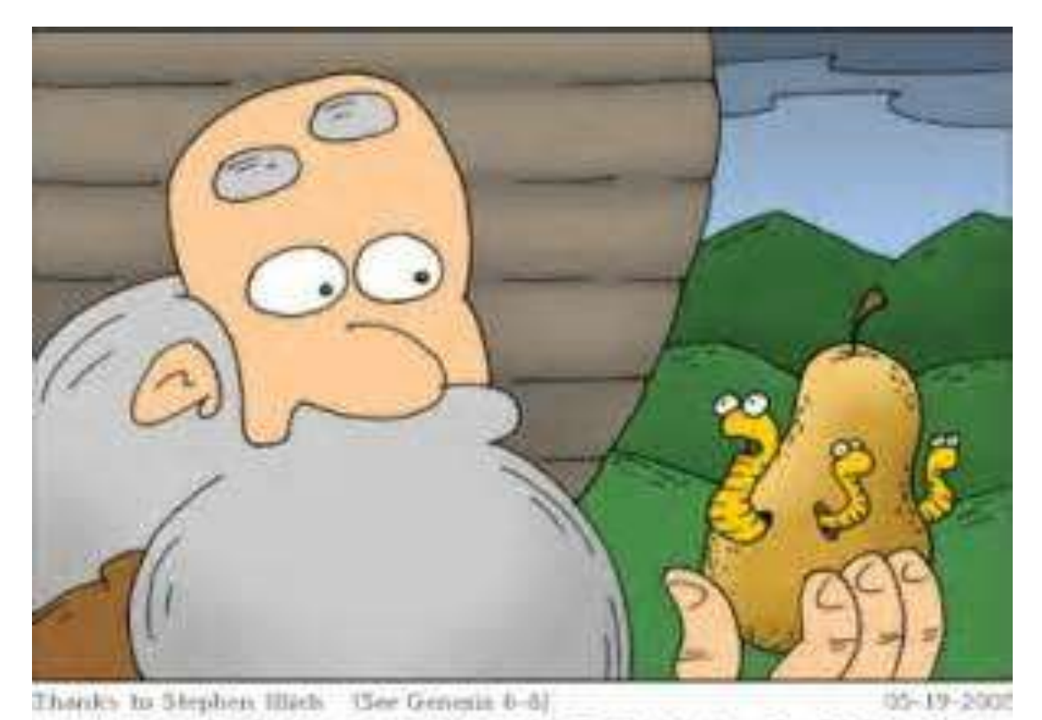
WE WERE TOLD YOU WERE TAKING CREATURES THAT CAME TO YOU IN PEARS