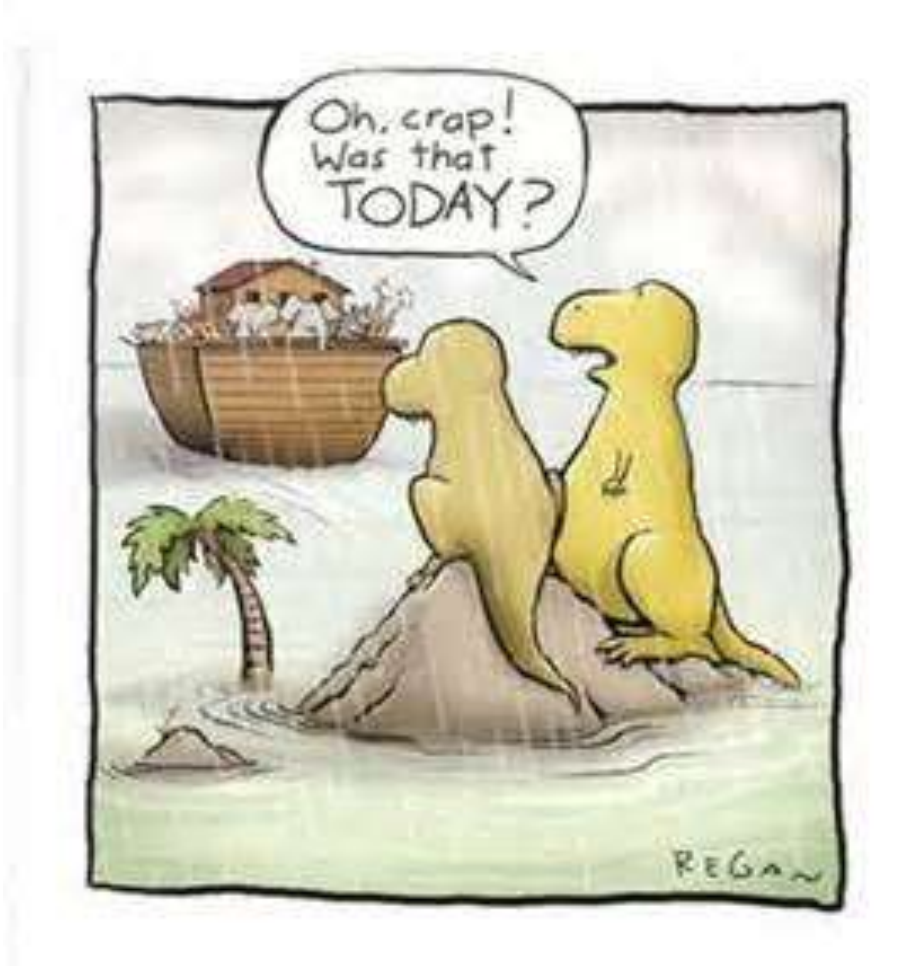
Don't Miss the Boat