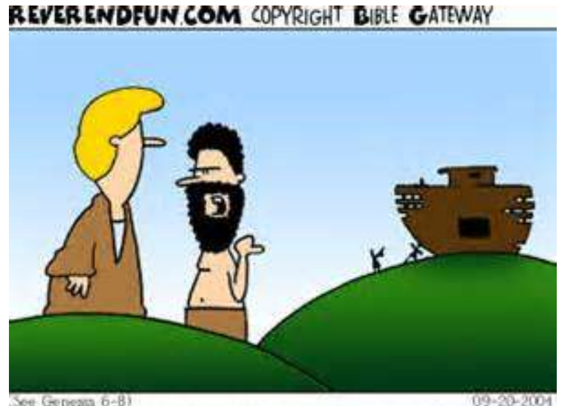
I JUST TALKED WITH THAT NOAH GUY AND HE CLAIMS THAT HE IS BUILDING THAT THING "FOR A RAINY DAY"